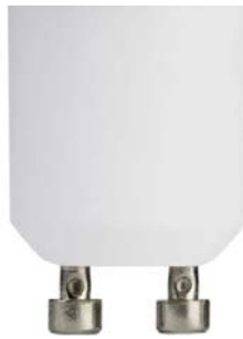
Close-up of GU10 connector