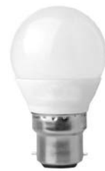
Spherical 'Golf Ball' or 'Ping Ball'