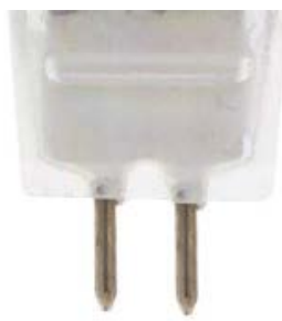
Close-up of MR16 /GU5.3 connector