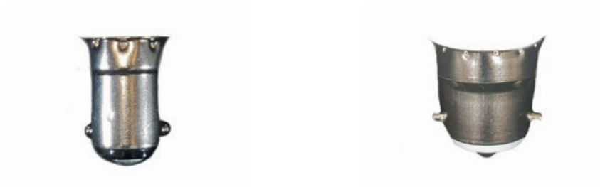
Small Bayonet Cap

You will find bayonet caps in 2 main varieties....